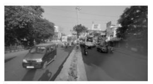
3, IMAGE RESIZING