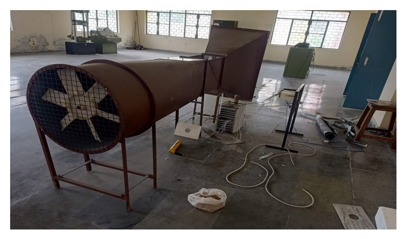
Figure 2.3 Experimental setup