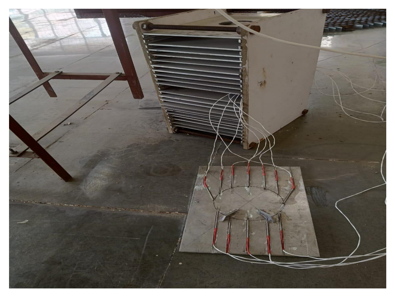
Figure 2.1 Rectangular Channel Plate

The flow resistance and Heat transfer characteristics have been compared for all the four configurations of the winglet, viz., CFD and CFU configurations in downstream and upstream locations using friction factor (f).