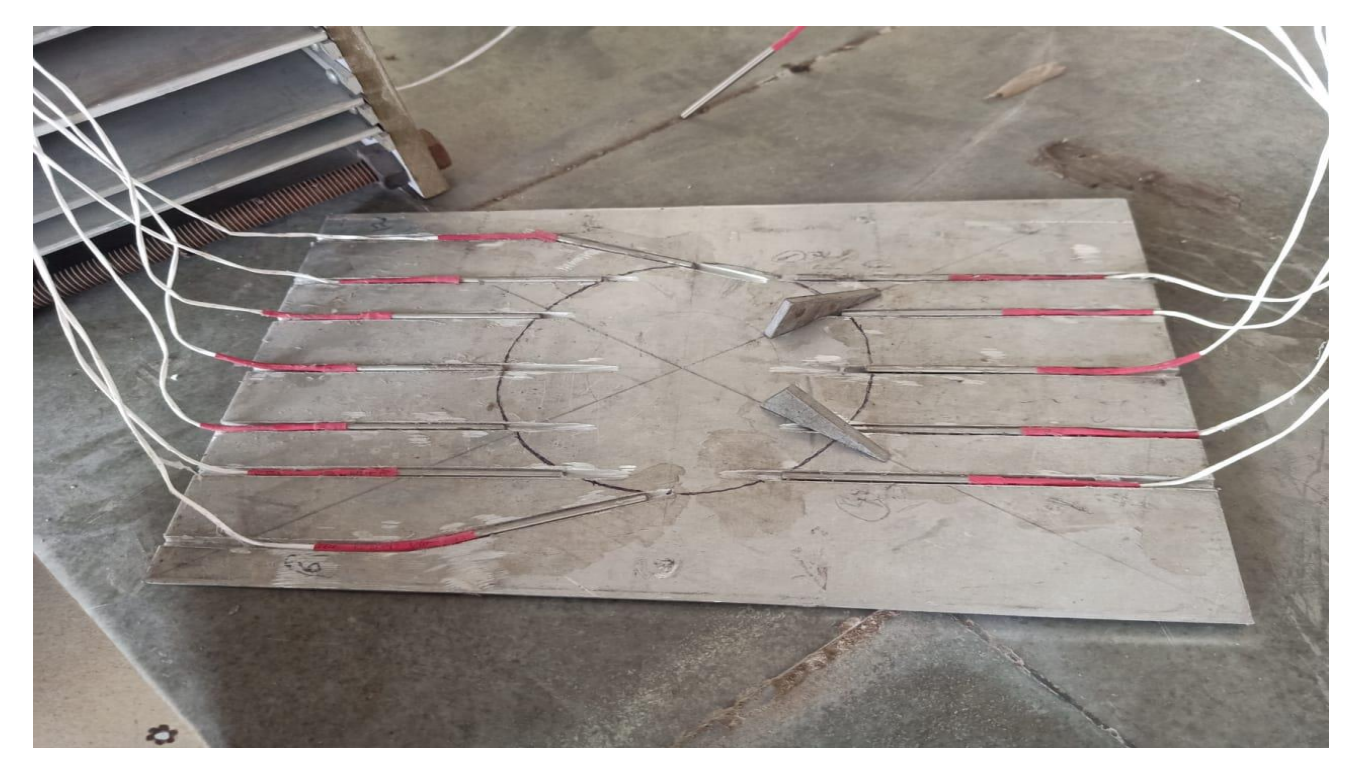
Figure 2.2 Location of the Winglet

Volume 13, No. 2, 2022, p. 3042 - 3049 https://publishoa.com ISSN: 1309-3452