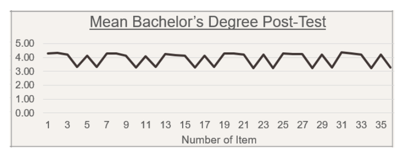
Chart 4: Mean of Bachelor's Degree Post-Test

Referring to Chart 3, 35 items are collected with the highest mean of 3.0 for item 1, item 7, and item 9. Then, referring to Chart 4, the mean range for the "National Prosperity and Unity Module" for the post-test study changed from 3 to 4 where the highest mean is 4.31.