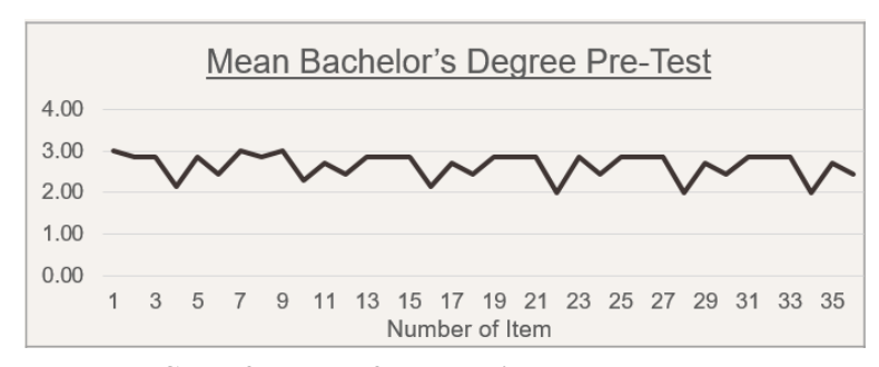
Chart 3: Mean of Bachelor's Degree Pre-Test

Referring to Chart 1, 24 items are collected with the highest mean of 4.07 for item 5 and item 19. Then, referring to Chart 2, by looking at the post-test result, the mean for the module increases.