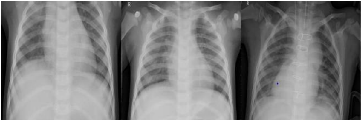
Figure 4: Pneumonia Cases