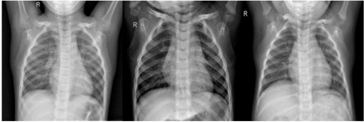
Figure 3: Normal Cases